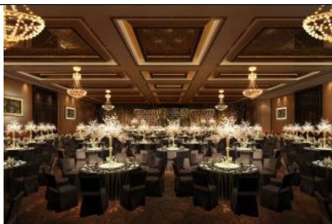
P005 & P006